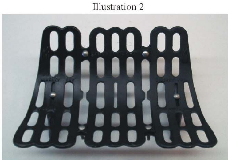
ASSEMBLED GRATE (G500-24 shown)