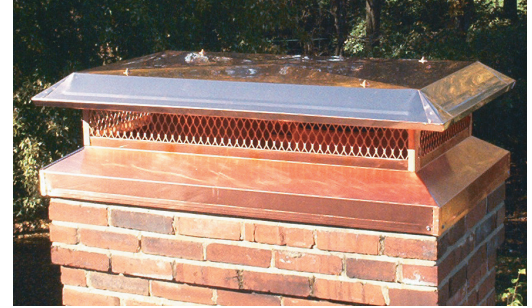
Copper Skirt Type Pictured