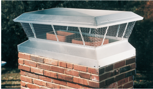
Aluminum Skirt Type Pictured